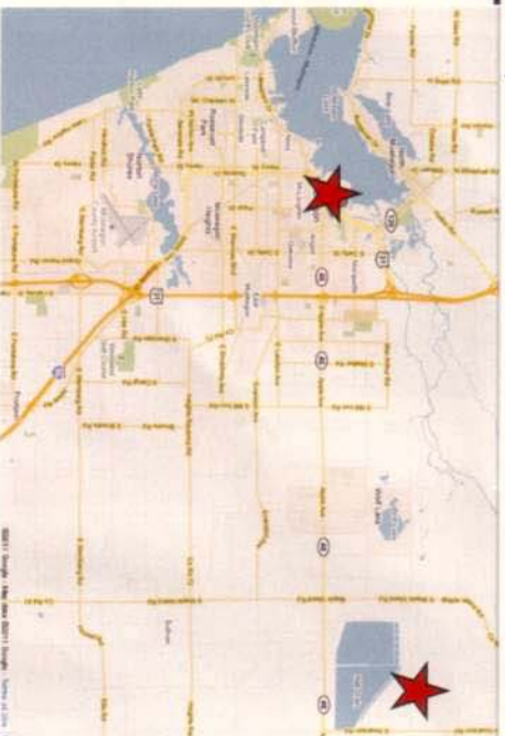
Map of Hotel and Launch Site:

At the Muskegon County Waste Water Facility 8301 White Road, Muskegon, Michigan GPS: N43.263144, W-86.02958